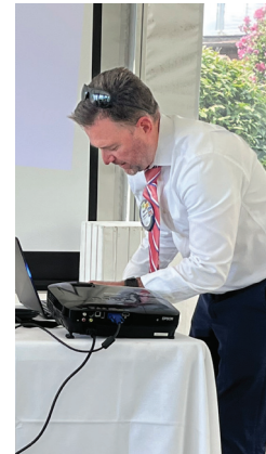
Preparing for a Power point that never worked